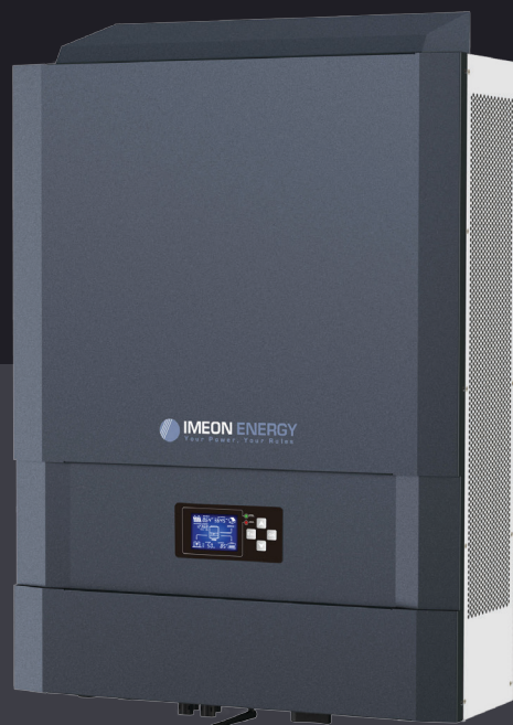
IMEON 9.12 Up to 12kWp Three phase