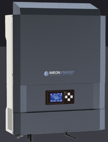
IMEON 3.6 Up to 4kWp Single phase